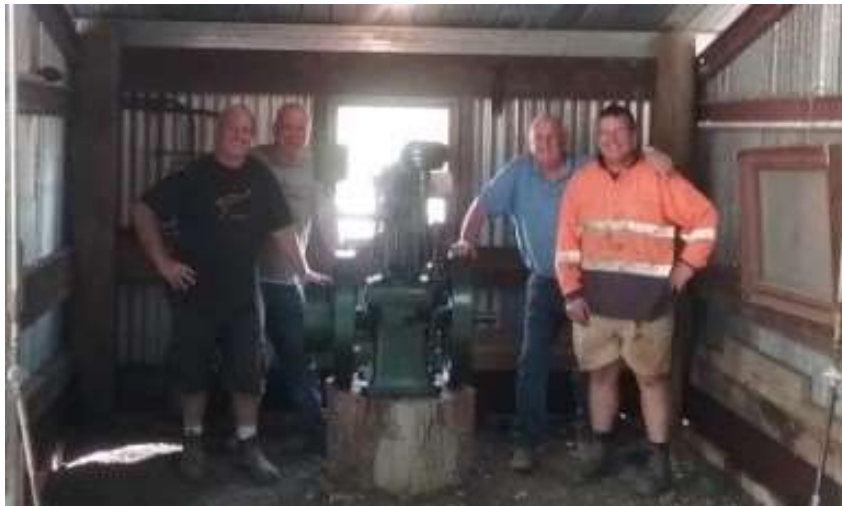
Page 8 | 14