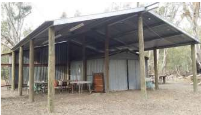
Progress on the Community Shed