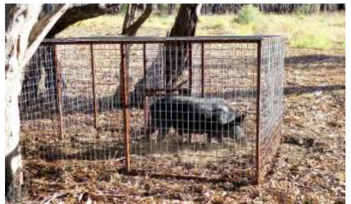
The Flying Pig (with wings clipped!)