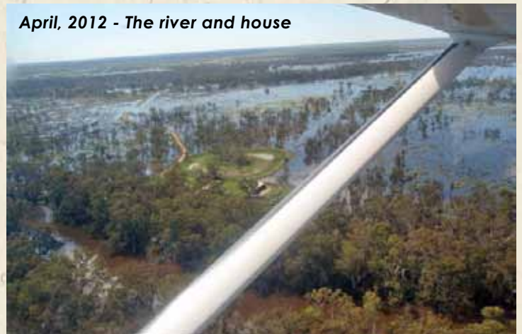
April, 2012 - The river and house