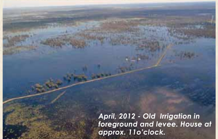
April, 2012 - Old Irrigation in foreground and levee. House at approx. 11o'clock.

All PTIC cows (pregnancy tested in calf) are in Nooran with PTIC maiden heifers in Woolshed. Steers and heifers are in Pump frontage.