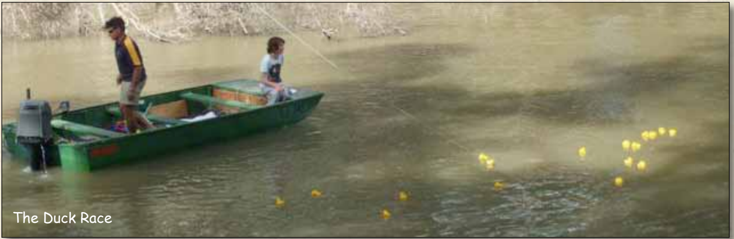
The Duck Race

Easter was a successful weekend with many families appreciating the break. The 3rd generation of several families came together to enjoy the beautiful weather and the pursuits the property has to offer. The social shoot attracted the usual suspects followed by the bbq attracting a crowd of 126. Thanks to the ladies that wandered down to help with prepping for Friday's BBQ and the crew who cooked a great feed, Saturday afternoon and evening was spent making sure no one in campground got de-hydrated!! Easter Sunday began (very slow for some people) with the Easter Egg hunt/carnival activities (Olympic games crew well done) /duck race/drawing competition all creating absolute organized chaos, but fun anyway. All this culminated with the most spectacular fireworks on Sunday Evening.