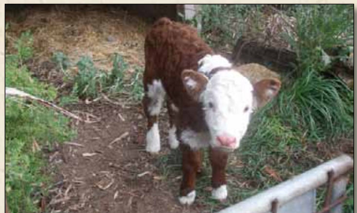
Bart the bull - 2 weeks old