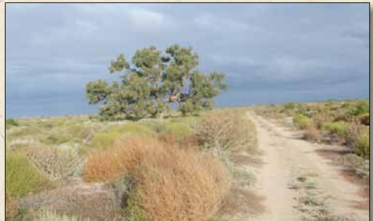
Dry lake paddock