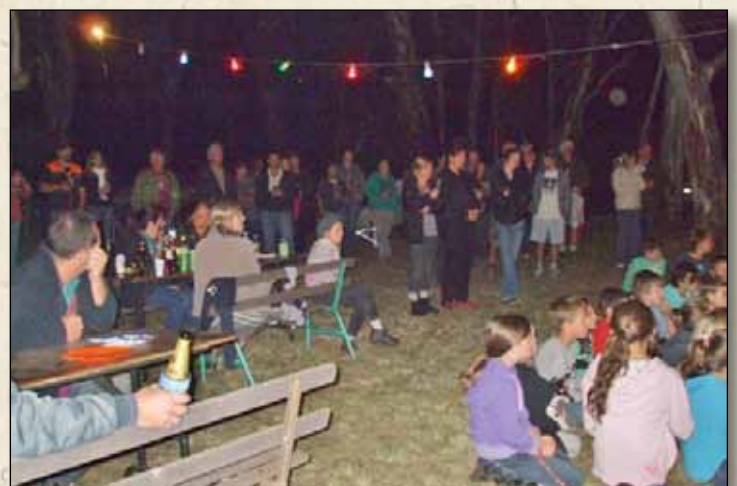
The Good Friday BBQ gathering