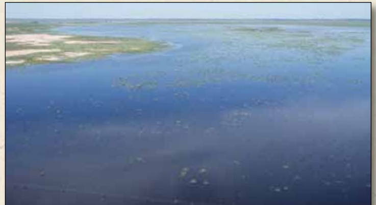
Rain water looking at toopuntul from oxley station