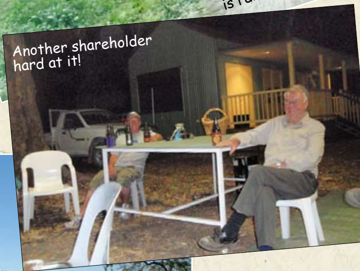
Another shareholder hard at it!