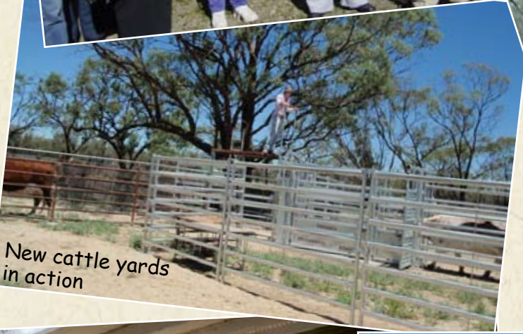
New cattle yards in action