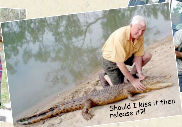
Should I kiss it then release it?!