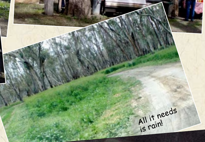
All it needs is rain!