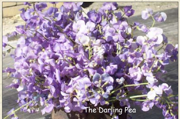
The Darling Pea

Last year was another success and don't forget to pencil in for this year. A great night put on by the Oxley Recreation Club, however the auctioneers and pencilers had to contend with what can only be described as an invasion of bugs with bidders just imbibing and yelling more!!!