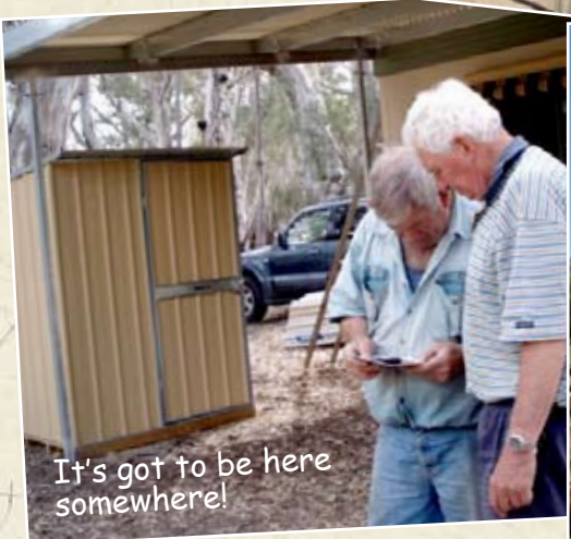
It's got to be here somewhere!