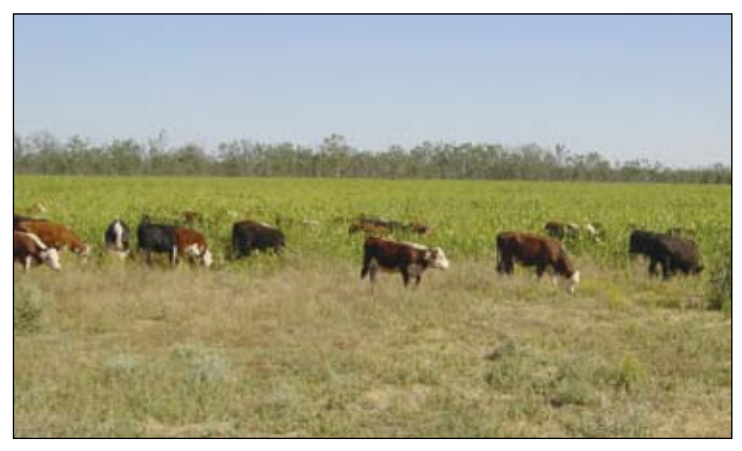
Weaners grazing on sorghum in Dry Lake.

the next few months. This is the second time in 5 years that the river has dried up and the fourth time in five years that the lakes have been dry. At the moment the river is back within its banks At present we are managing to run approx 660 head of cattle. In January we preg tested and weaned and a 92% ptic was achieved. The cows have been moved up to the Lachlan country on the sorghum and the weaners are in Dry Lake on the sorghum. The empty cows and some steer weaners were sold.