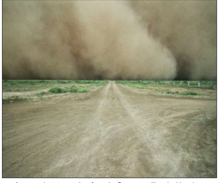
A severe duststorm taken from the Boyong mailbox looking down towards house and campground.